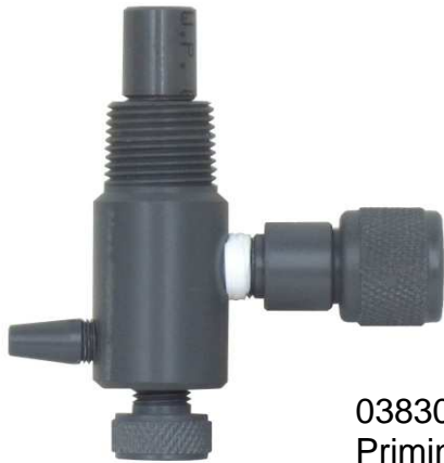
03830 Priming IPF

Please open and inspect your package upon receipt. Your package was packed with great care and all the necessary packing materials to arrive to you undamaged. If you do find an item that is broken or damaged, you must contact the delivering carrier to report the claim.